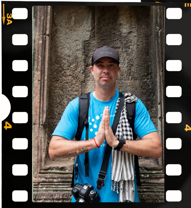
Steve Scurich PPA Master Photog.

Instruction team is planned but may be changed if needed due to certain situations that can occur.